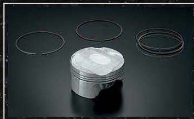
NEW PISTONS - 3% LIGHTER