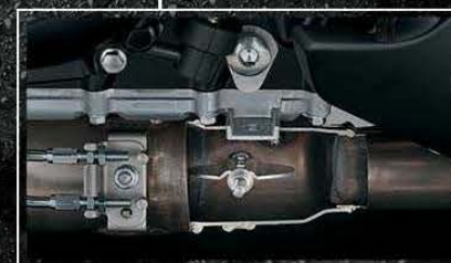
SUZUKI EXHAUST TUNING VALVE