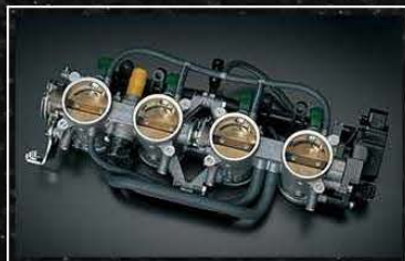
GSX-R DUAL THROTTLE VALVE